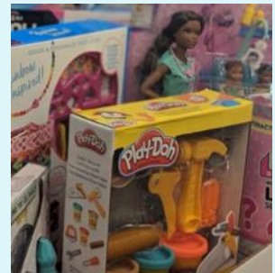
Fun for preschoolers