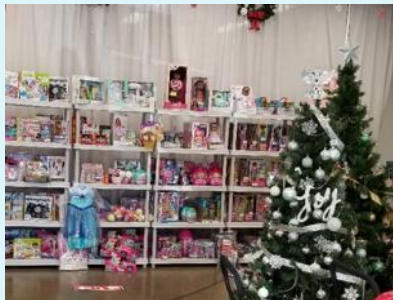
Shelves stocked with toys

Here are pictures of last year's Christmas shop – shelves filled with donated toys and games and books for little hands to discover. Toys have already started coming in – we'd like your help for these families to provide for their own by donating between November 6 and December 12. Drop your gifts in the box located near the youth room.