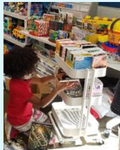
Time for a good book