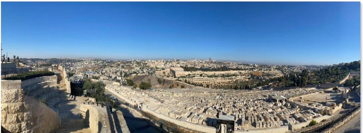
Panoramic view from the top of the Mount of Olives, looking into Jerusalem

I was blessed this summer by being able to join my Father, Grandfather, Step-mother and their church group on a 10 day journey to Israel. We traveled with Educational Opportunities, a Christian tour company. We stayed 3 nights in the city of Tiberias, on the coast of the Sea of Galilee. We then traveled to Jerusalem for the remainder of our time. Each day was filled with visiting areas all across Israel including: Capernaum, Jerusalem, Bethlehem, Jericho, Qumran, Masada, the Dead Sea, Caesarea, and Nazareth.