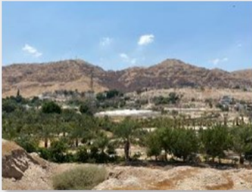
View west from Jericho

These were the mountains the spies hid in when scouting out the land for Joshua.