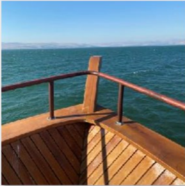
The Sea of Galilee